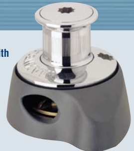
Freedom with Capstan